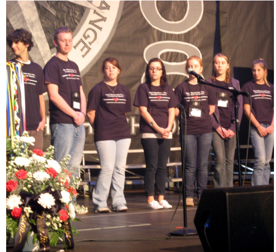
Student members of the PASC Board are recognized at the State Conference in November.