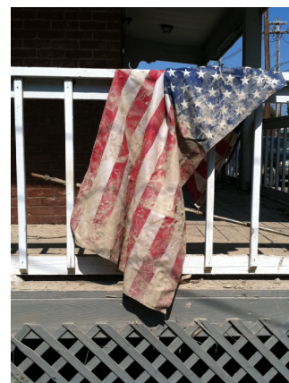
The 2012 State Conference Charity will help families in need who were affected by the floods in PASC Districts 7, 8, and 9.

Check out our website at PASC2012.org for quick fundraising ideas and pictures from the flooded areas. Also, tell us what you are doing on the Keep It Campaign FB page, and maybe it will encourage others.